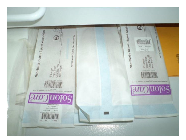
Cottons for optical applications.