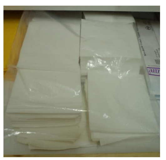
Clothes for optical applications.