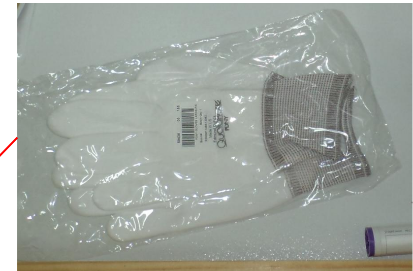
Polyurethane gloves by Edmund Optics.