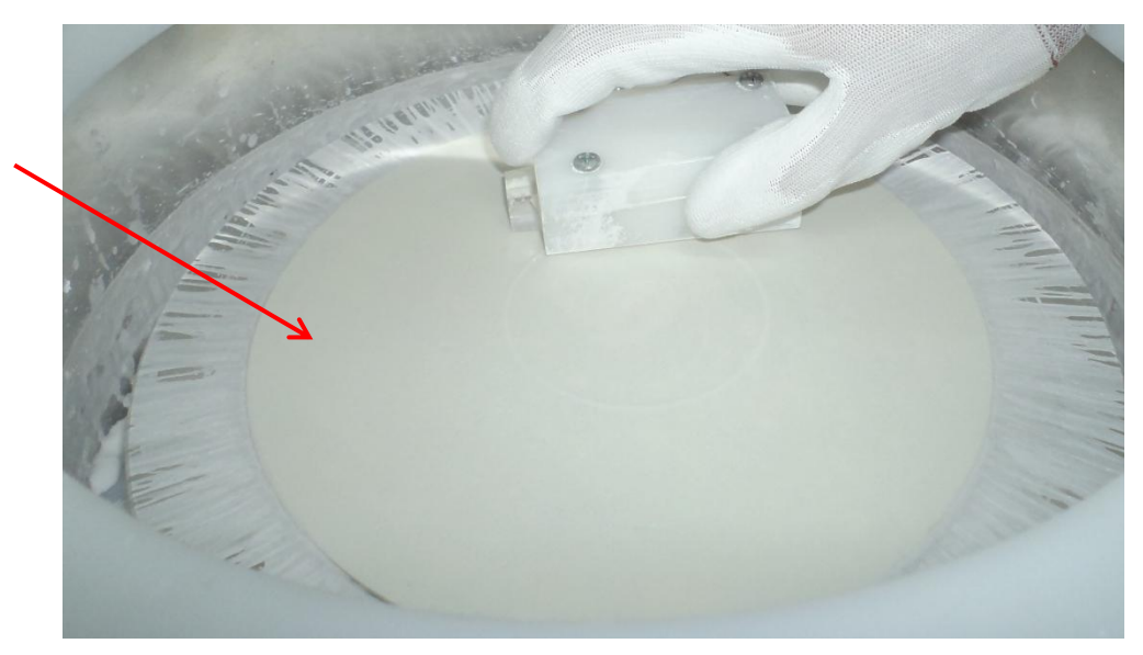
Cloths: TexMet & MicroCloth by Buehler.